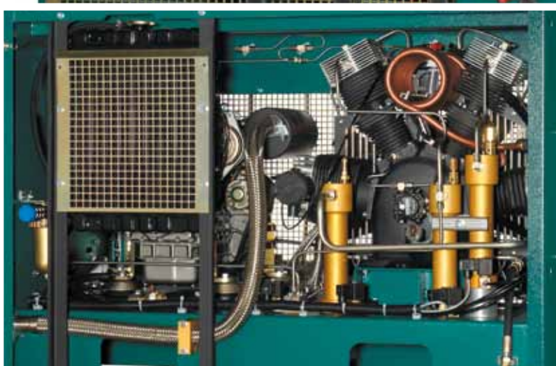
LW 570 D Rear view